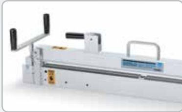
845LD Belt Cutter

The Flexco Laser Belt Square can be used in conjunction with these Flexco products to keep belts up and running at peak performance.