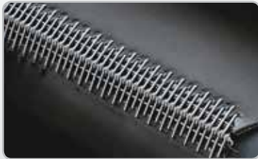
Anker® Wire Hook Fastening System