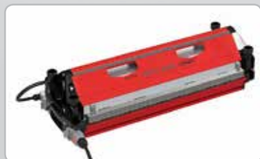
Novitool® Belt Fabrication Tools