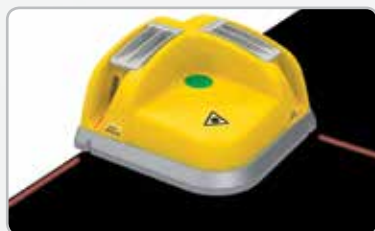
Laser Belt Square