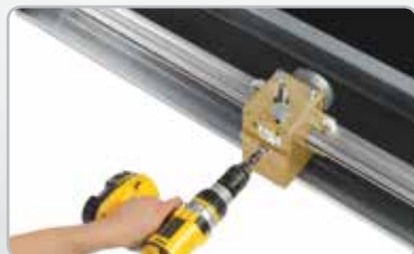
Clipper® Wire Hook Fastening Systems