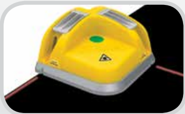
In a fraction of the time of conventional squaring, the Laser Belt Square finds the edge of the belt, aligns the laser, and produces an accurate line for marking and cutting.