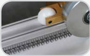
Clipper® maintenance lacers — quick, on-site installation of G Series™ lacing with precision Roller Lacing Technology™