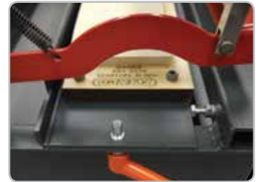
Easy positioning and clamping