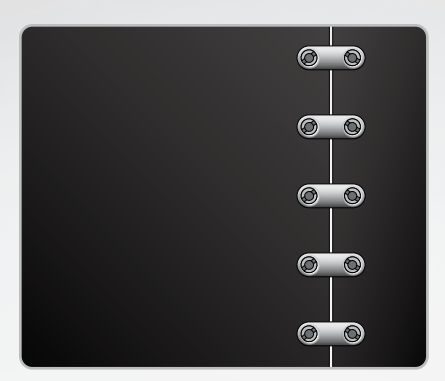
For lengthwise rips, standard Flexco® solid plate fasteners are recommended. Repair fasteners should always be applied crosswise on the belt for smooth travel over pulleys.