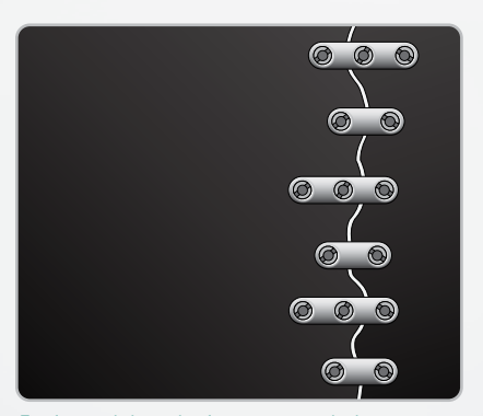
For jagged, lengthwise conveyor belt tears, or for bridging "soft spots," standard Bolt Solid Plate Fasteners can be combined with threebolt Rip Repair Fasteners.