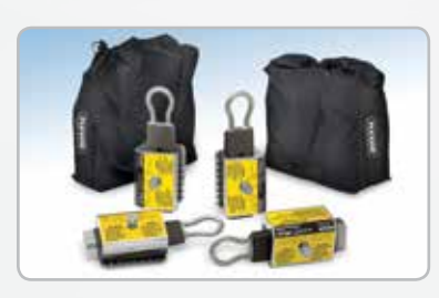
Smart Clamp<sup>™</sup>Belt Clamps