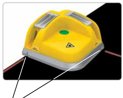
Lasers are conveniently located close to the edge of the unit for use in tight areas and for belts with side pans.

Magnetic targets snap directly into the laser housing for convenient storage and use.