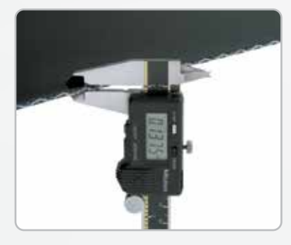
Measure belt thickness.