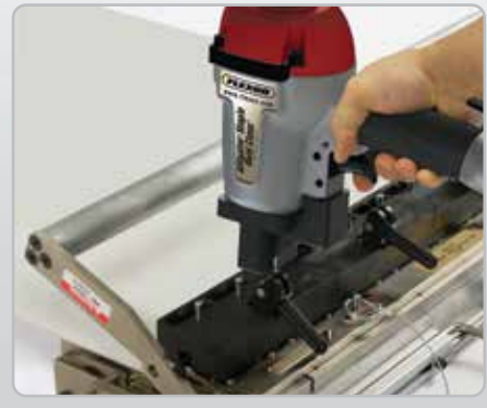
Final Set: With additional trigger pulls, the staples receive their final set and the compression fit is obtained.