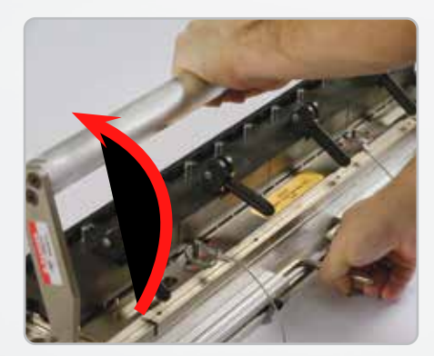
Simple Adjustment: After the fasteners are initially set, simply flip the handle.

Initial Set: Fasteners and belt are inserted into the base where the pre-staked staples are driven through the belt with simple trigger pulls.