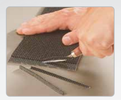
Skive impression cover.