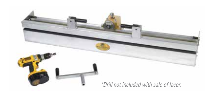
Face Strips sold separately