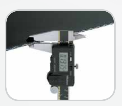
Measure belt thickness.