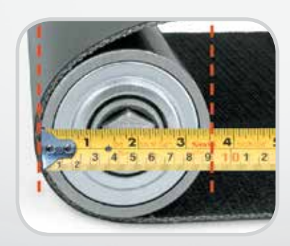
Measure smallest pulley diameter.