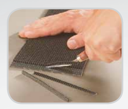
Skive impression cover.

Refer to the material selection chart on page 2 for the metal characteristics which best suit your application. Not all sizes and styles are available in all metals.