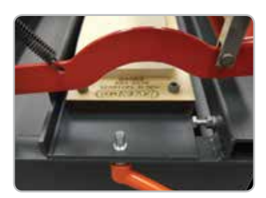
Easy positioning and clamping