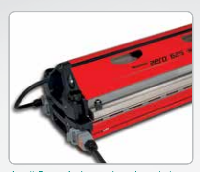
Aero® Press: An innovative, air-cooled press that does not require external components. Complete cycle time is approximately 10 minutes, significantly increasing belt productivity.