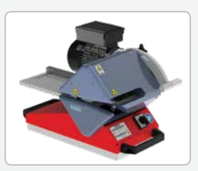
Ply 130™ Ply Separator: The robust design allows for quick, effortless, and precise ply separation on thermoplastic belts even extremely thin or difficult belts.