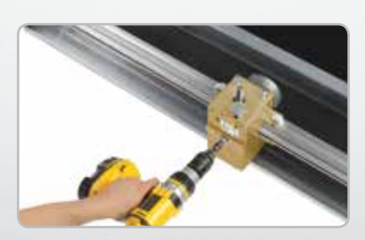
Clipper<sup>®</sup> Wire Hook Fastening Systems