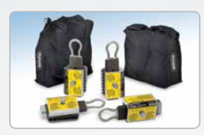
Smart Clamp<sup>™</sup> Belt Clamps

Use the 845LD Belt Cutter in conjunction with these Flexco products to keep belts up and running at peak performance.