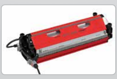
Novitool<sup>®</sup> Belt Fabrication Tools