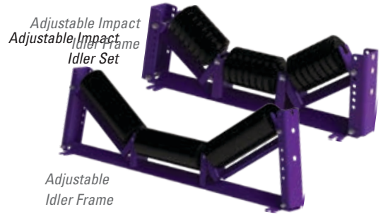
Adjustable Impact Idler Frame