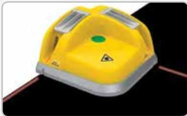
Laser Belt Square