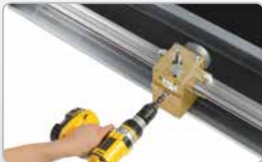
Clipper® Wire Hook Fastening Systems