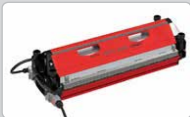
Novitool® Belt Fabrication Tools