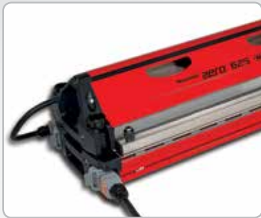
Aero® Press: An innovative, air-cooled press that does not require external components. Complete cycle time is approximately 10 minutes, significantly increasing belt productivity.