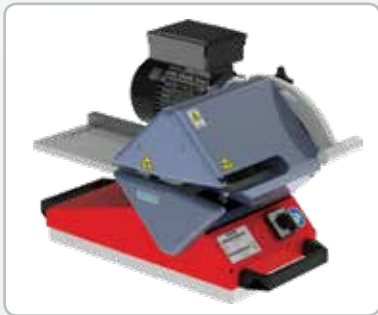
Ply 130° Ply Separator: The robust design allows for quick, effortless, and precise ply separation on thermoplastic belts - even extremely thin or difficult belts.