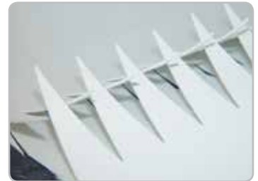
Punches precise fingers