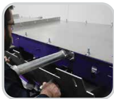
Externally replaceable liners for easy maintenance

Adjustable Liners provide increased skirt liner life