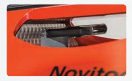
99 recipes can be input and stored directly on the press, while 990 additional recipes can be input through the Aero Recipe Management Tool on your computer and transferred to the press via a USB flash drive.

The proprietary Flexco Aero* Recipe Management Tool makes it easy to import, create, or modify recipes. Recipes can then be exported from the tool and transferred to your press via a USB flash drive. Users with multiple presses can quickly load the same set of recipes to all of their equipment.