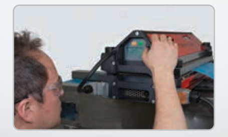
Programming the Aero® Press is particularly easy with an HMI control panel, and the intuitive scroll through navigation means you'll be producing your first high quality splice in no time.