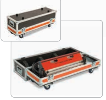
Portable storage case makes transport easy and includes storage for power cords. Shallow bottom makes it easy to remove larger presses.