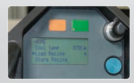
Load saved recipes to ensure consistent, high quality splice performance, regardless of which technician is operating the press.