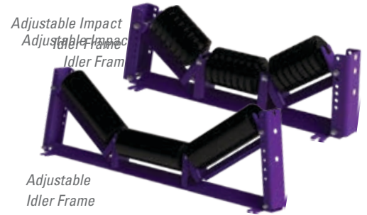
Adjustable Impact Idler Frame