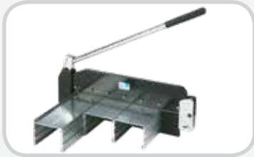
14" Belt Cutter