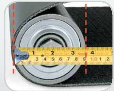
Measure smallest pulley diameter.