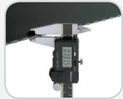
Measure belt thickness.