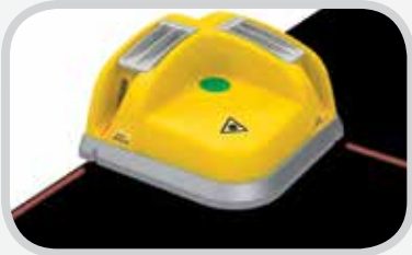
Laser Belt Square