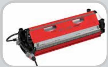
Novitool® Belt Fabrication Tools