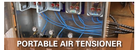
PORTABLE AIR TENSIONER

Flexco developed the FMS cushion, which was successfully trialed at numerous iron ore sites. The new cushion reduces buildup and improves cleaning efficiency on the toughest belt conveyor systems, ensuring the belt cleaners maintain optimum cleaning efficiency between shutdown periods.