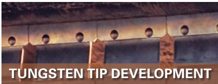
TUNGSTEN TIP DEVELOPMENT

Originally, Flexco tungsten tips were 10mm; however, Flexco saw the need to develop a 15mm 'extra-life' tip specifically to keep up with current standards for iron ore. Additionally, a 25mm tip was made to combat high-wear areas and cater to extended run time between shutdowns.