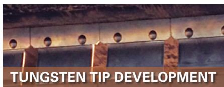
TUNGSTEN TIP DEVELOPMENT

Originally, Flexco tungsten tips were 10mm; however, Flexco saw the need to develop a 15mm 'extra-life' tip specifically to keep up with current standards for iron ore. Additionally, a 25mm tip was made to combat high-wear areas and cater to extended run time between shutdowns.