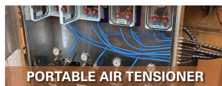
PORTABLE AIR TENSIONER

Flexco developed the FMS cushion, which was successfully trialed at numerous iron ore sites. The new cushion reduces buildup and improves cleaning efficiency on the toughest belt conveyor systems, ensuring the belt cleaners maintain optimum cleaning efficiency between shutdown periods.