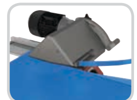
Optional step cutter prepares belts by quickly removing the top ply with a simultaneous vertical and horizontal cut.