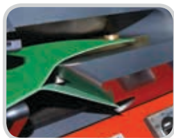
Accurate separation between belts, with cuts as thin as 0.35 mm (0.014")

The robust construction of the Ply 130 allows for precise separating of thermoplastic belts - both thin and thick. As little as 0.35 mm (*0.014") can be separated — allowing for users to create foil/film from the belt used in the splicing process.