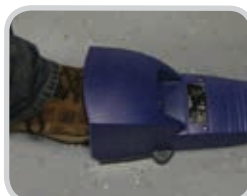
Foot switch controls forward belt motion, allowing for hands-free operation