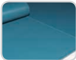
Allows operator to separate foil/film from cover of belt to fill gaps and cavities with same color and material of belt