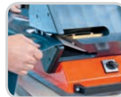
Separate up to 130 mm (5") in a single pass for perfect preparation of stepped splices and recessed mechanical fasteners