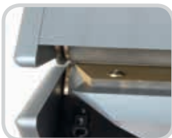
The solid fixture of the blade is guarded, with only a 10 mm (0.4") opening