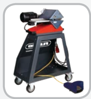
Optional Ply 130™ Cart *optimal cutting height of 960 mm (39")

The Ply Cart provides a convenient method of using the Ply 130™ throughout the light-duty workshop. It is no longer necessary to custom-build carts or purchase utility carts, which are not optimal for ply separator transport. Previously-purchased Ply 130 units are easily mounted onto the cart using a retrofit tray.