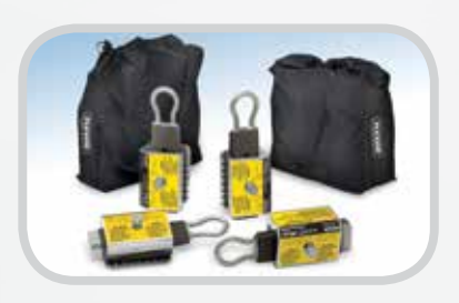
Smart Clamp<sup>™</sup> Belt Clamps