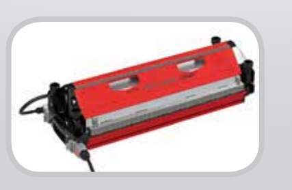
Novitool<sup>®</sup> Aero<sup>®</sup> Splice Press