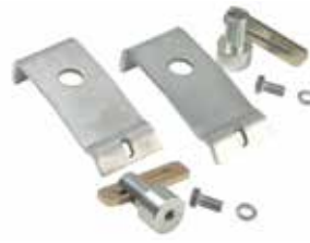
Bolt-On PAL PAK