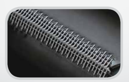
Clipper® Wire Hook Fastening System