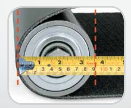
Measure smallest pulley diameter.