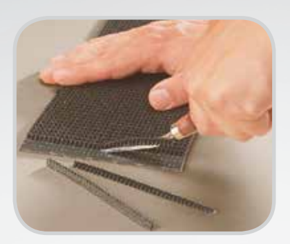
Skive impression cover.

Refer to the material selection chart on page 2 for the metal characteristics which best suit your application. Not all sizes and styles are available in all metals.