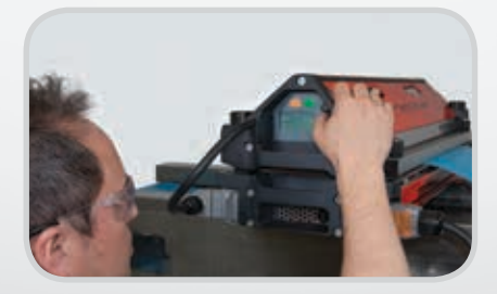
Programming the Aero® Press is particularly easy with an HMI control panel, and the intuitive scroll through navigation means you'll be producing your first high quality splice in no time.

Integrated Air Cooling – cooling fans are positioned in both top and bottom beams, reducing cool down time after splice is complete. Average splice times of 8-12 minutes can be expected.