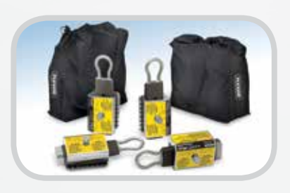
Smart Clamp<sup>™</sup> Belt Clamps