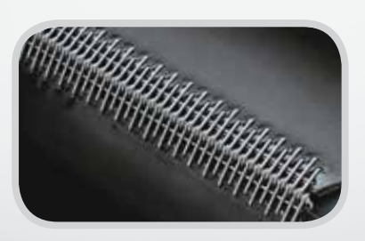
Clipper<sup>®</sup> Wire Hook Fastening System