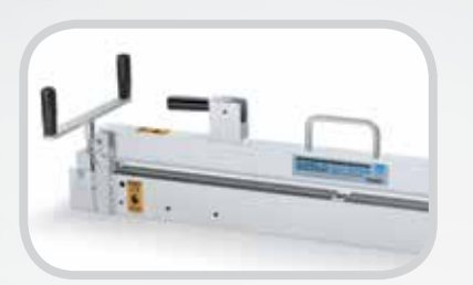
Clipper<sup>®</sup> 845LD Belt Cutter

The Flexco Laser Belt Square can be used in conjunction with these Flexco products to keep parcel belts up and running at peak performance.