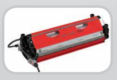
Novitool<sup>®</sup> Belt Fabrication Tools