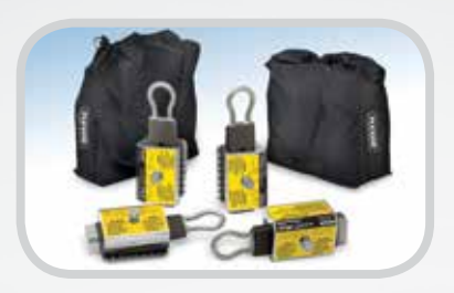
Smart Clamp<sup>™</sup> Belt Clamps

Use the 845LD Belt Cutter in conjunction with these Flexco products to keep parcel belts up and running at peak performance.