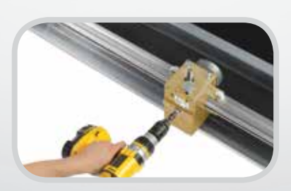
Clipper<sup>®</sup> Wire Hook Fastening Systems