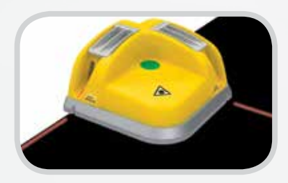
Laser Belt Square