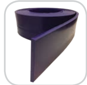
Standard Urethane Skirting is available for high-abrasion applications in areas such as clinker storage and near the finish mills.