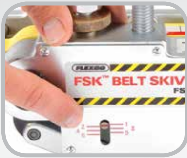
Easily select and set the depth of the skive.