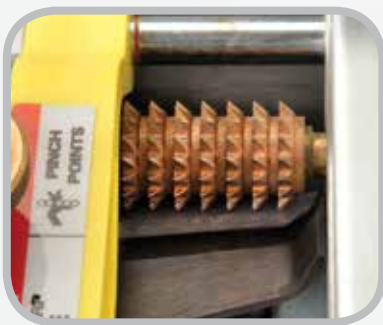
Front drive rollers aggressively grip belt at the start of the skive to prevent slippage.