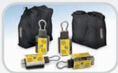
Smart Clamp™ Belt Clamps

Use the 845LD Belt Cutter in conjunction with these Flexco products to keep parcel belts up and running at peak performance.