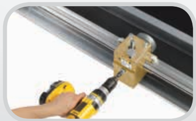
Clipper® Wire Hook Fastening Systems