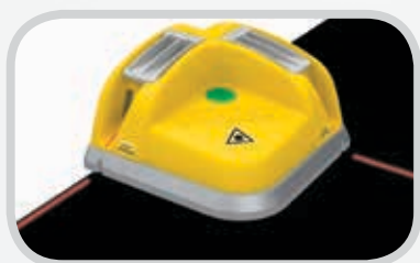
Laser Belt Square