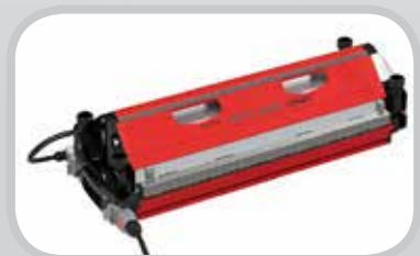
Novitool® Belt Fabrication Tools