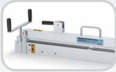
Clipper® 845LD Belt Cutter

The Flexco Laser Belt Square can be used in conjunction with these Flexco products to keep parcel belts up and running at peak performance.