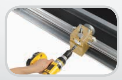
Clipper® Wire Hook Fastening Systems