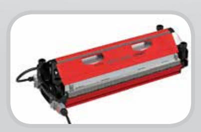
Novitool® Belt Fabrication Tools