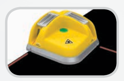
Laser Belt Square