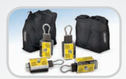
Smart Clamp™ Belt Clamps

Use the 845LD Belt Cutter in conjunction with these Flexco products to keep parcel belts up and running at peak performance.