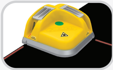
Laser Belt Square