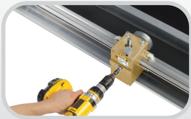
Clipper® Wire Hook Fastening Systems