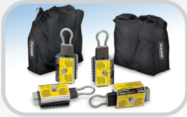
Smart Clamp™ Belt Clamps

Use the 845LD Belt Cutter in conjunction with these Flexco products to keep parcel belts up and running at peak performance.