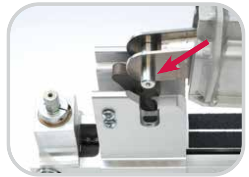
Align the clamp beam in the uprights

The top clamp beam can be removed quickly by simply depressing the quick release latch. Installing the top clamp beam is even easier – just align the clamp beam in the uprights and allow the beam to drop into position. Final clamping pressure is achieved with a few turns of the pivoting arm Acme threaded screw system for complete engagement of the clamp.