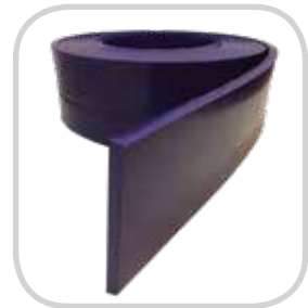
Standard Urethane Skirting is available for high-abrasion applications in areas such as clinker storage and near the finish mills.