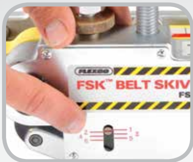
Easily select and set the depth of the skive.