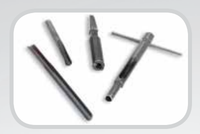
Hand installation tools