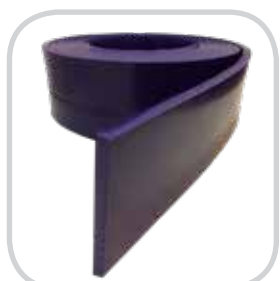
Standard Urethane Skirting is available for high-abrasion applications in areas such as clinker storage and near the finish mills.