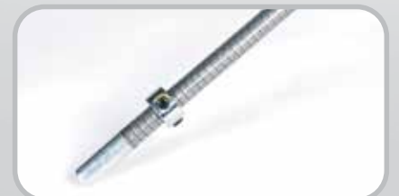
Hinge Pin Retaining Collar

Prevent “pin migration.” These utilize knurled point screws and self-locking nylon patches to hold hinge pin in place.