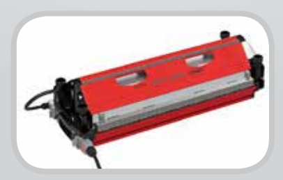
Novitool® Belt Fabrication Tools