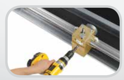
Clipper® Wire Hook Fastening Systems