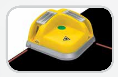
Laser Belt Square