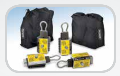
Smart Clamp™ Belt Clamps

Use the 845LD Belt Cutter in conjunction with these Flexco products to keep parcel belts up and running at peak performance.