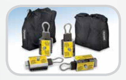
Smart Clamp<sup>™</sup> Belt Clamps