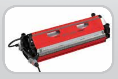
Novitool<sup>®</sup> Aero<sup>®</sup> Splice Press

Clipper<sup>®</sup> Wire Hook Fastening System