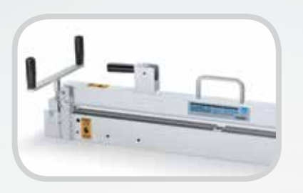
Clipper<sup>®</sup> 845LD Belt Cutter

The Flexco Laser Belt Square can be used in conjunction with these Flexco products to keep parcel belts up and running at peak performance.