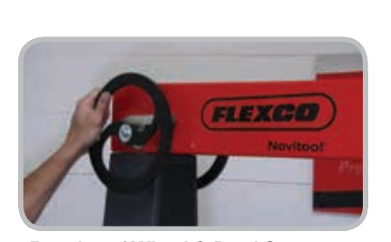
Function of Wheel & Pawl System The wheel and pawl system off loads the counterweight so that the weight of the top beam can completely release air and sit flat on the bottom beam.