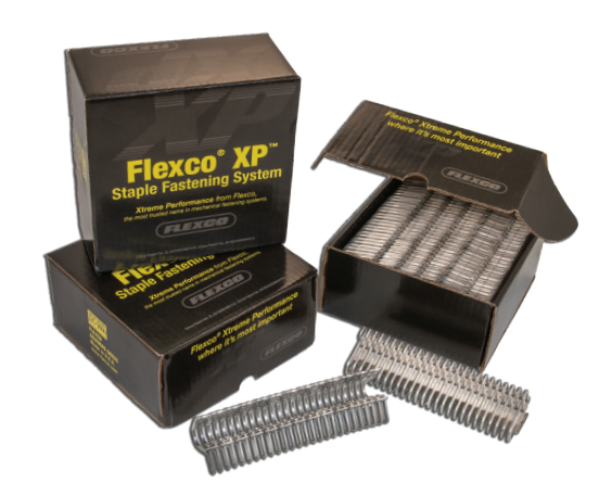
Each Flexco® XP™ Staple package contains enough fastener strips to complete a single splice. Hinge pins are ordered separately.