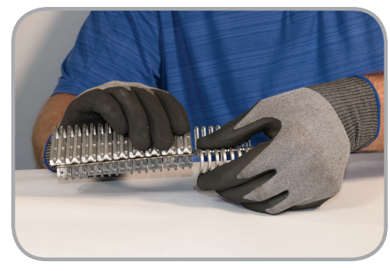
Adapting for your belt width is easy, simply shorten the length of a strip by twisting off the length you need. Leftover strip lengths can be combined with full strips to complete a splice, eliminating waste.