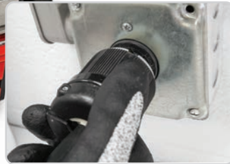
The Aero Press accommodates multiple voltages based on the power cord selected. Refer to the chart below.