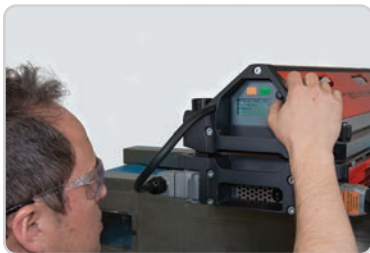
Programming the Aero® Press is particularly easy with an HMI control panel (Human Control Interface), and the intuitive scroll through navigation means you'll be producing your first high quality splice in no time.