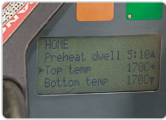
Ability to set independent temperatures of top and bottom heating elements to ensure optimal splice.

Designed to Meet Stringent Safety Requirements, The Novitool® Aero® has been assessed by an independent company to meet CE requirements for high safety, health, and environmental protection, demonstrating the Flexco level of commitment to both Safety and Quality for our customers.