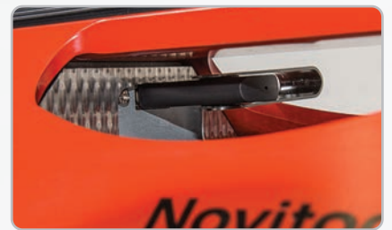
99 recipes can be input and stored directly on the press, while 990 additional recipes can be input through the Aero Recipe Management Tool on your computer and transferred to the press via a USB flash drive.

The proprietary Flexco Aero® Recipe Management Tool makes it easy to import, create, or modify recipes. Recipes can then be exported from the tool and transferred to your press via a USB flash drive. Users with multiple presses can quickly load the same set of recipes to all of their equipment.