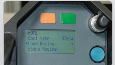
Load saved recipes to ensure consistent, high quality splice performance, regardless of which technician is operating the press.