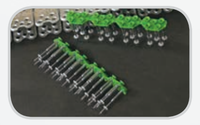
Rapid Loader <sup>™</sup> Rivet Strips with Washers Used with Collated Rivets for quick, easy loading into guide block. The washer ensures maximum accuracy.