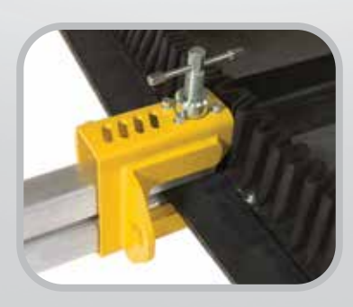
TUG HD Belt Clamps are perfect for use with sidewall belts. Ordering numbers for a pair of 300 mm (12") bars are TUG6B-12-AL, TUG8B-12-AL.