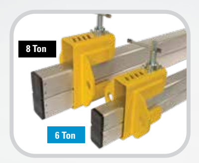
6 ton clamps are available for belts up to 1800 mm (72") wide and up to 50 mm (2") thick, while the 8 ton clamps are available for belts up to 2400 mm (96") wide and up to 55 mm (2 1/4") thick.

TUG™ HD® Belt Clamps are engineered for heavy-duty applications and can be used with a variety of materials and belt types.