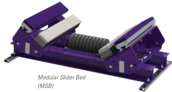
Modular Slider Bed (MSB)