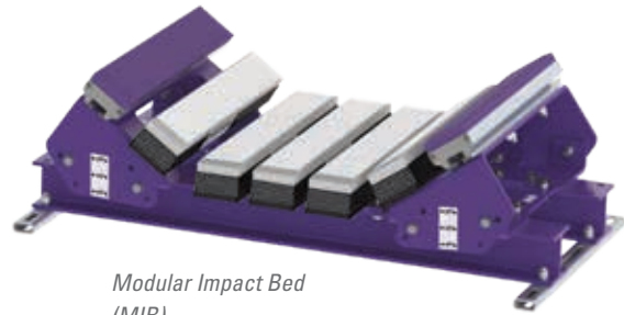
Modular Impact Bed (MIB)