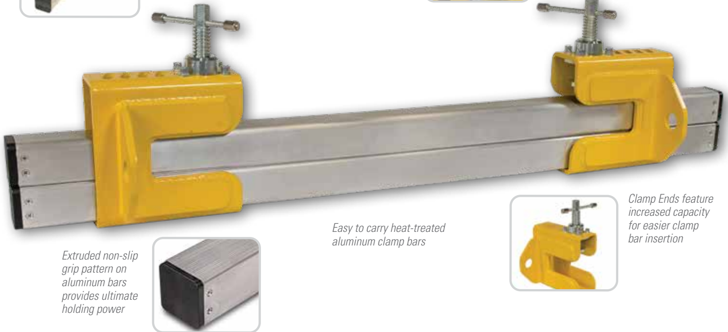
Extruded non-slip grip pattern on aluminum bars provides ultimate holding power