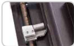
Hold down shaft also acts as a blade guard