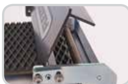
Closed cover clamps belt tightly in place to allow for uniform skive