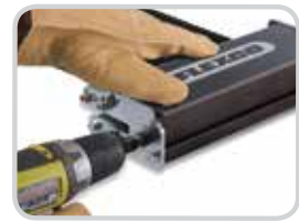
Driven with an electric drill or ratchet