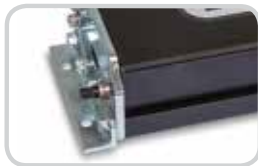
Optional bench mounting kit for belt shop use

Hand skiving baler belts takes time and precision. The Flexco Baler Belt Skiver is a safe and effective tool for quickly and easily skiving baler belts. Simply set the skive height, close the cover, and skive your belt in less than 30 seconds using a cordless drill. With the cover closed, the blade is completely enclosed during the skiving process eliminating the chance for injury while skiving.