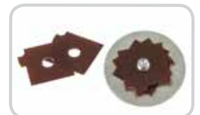
Skive depth is adjustable with use of shims – tool includes convenient storage location so shims are available when you need them.